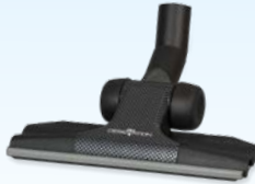
RD 285 DESIGNATION

Uniquely designed crevice nozzle for hard floor cleaning. Superb performance. Engineered to deliver exceptional test results.