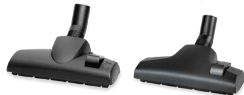
RD 264+ / RD 265

The perfect entrance level floor nozzle. This buy and forget nozzle is perfect for price attractive vacuum cleaners.